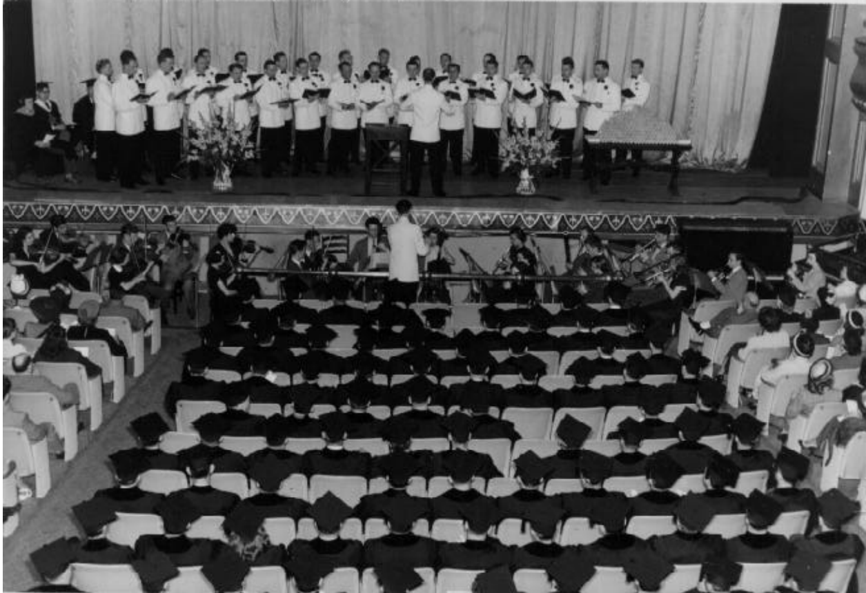
Commencement exercises at Lincoln Chiropractic College of Indianapolis on May 20, 1949, as depicted in the Journal of the National Chiropractic Association 1949 (July); 19(7): 37