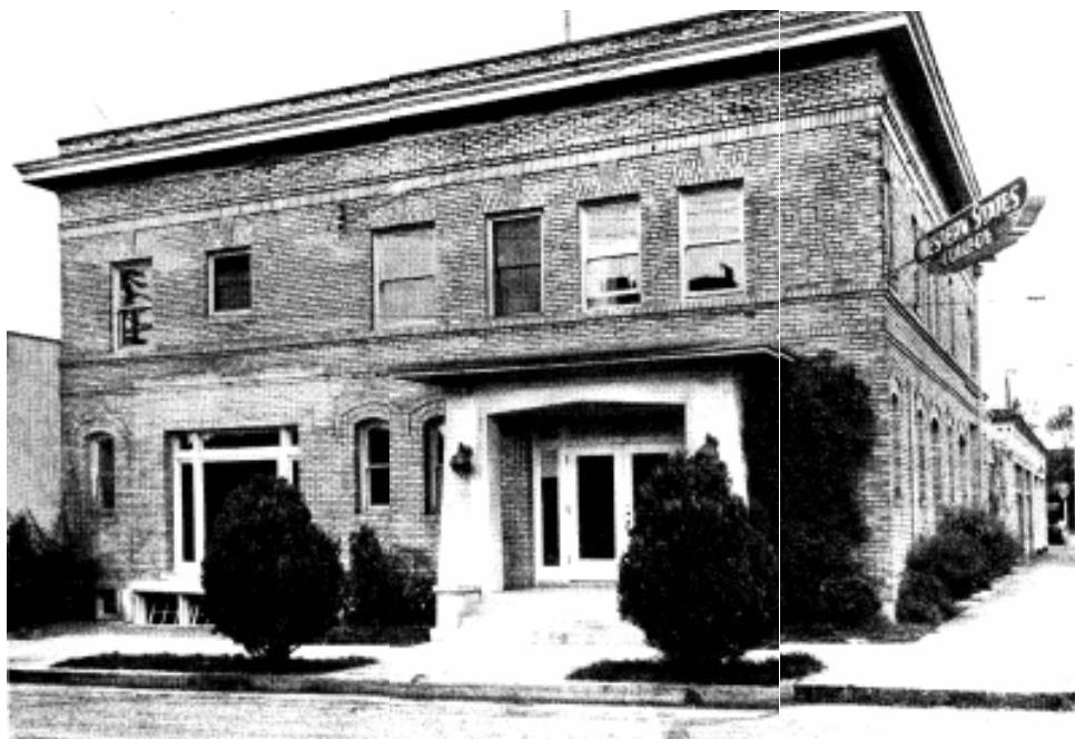
Western States Chiropractic College, 1536 S.E. 11th Avenue, Portland, Oregon, circa 1938