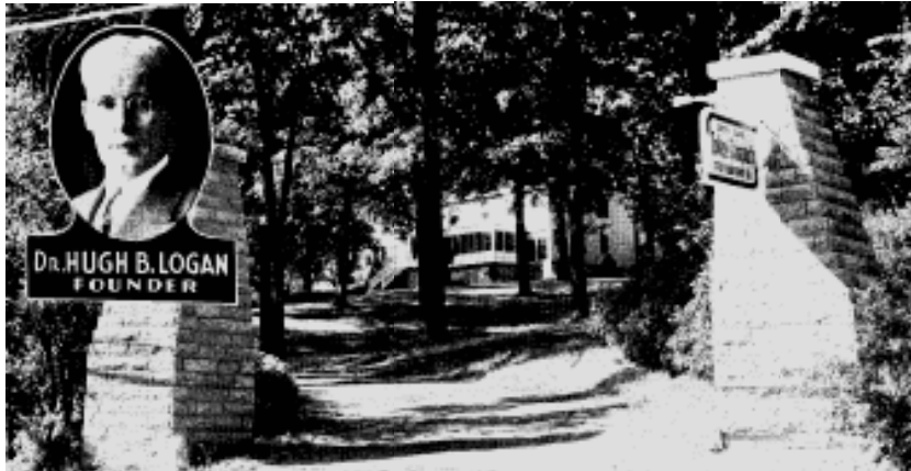
Logan Basic College of Chiropractic, 7701 Florissant Road, St. Louis, Missouri, circa 1938

The only purpose in comparing Russian and American medical organizations is to bring to the reader some idea of what scientific organization means to any science. It would be very difficult to compare chiropractic scientific organization to medical organization, and I shall not attempt to do so. However, in a later chapter I shall outline a plan of chiropractic scientific organization. In his own mind the reader can compare the scientific organization of chiropractic with that of medicine and the rest of organized science. If the reader will keep in mind the principles, methods, attitudes, and organization of science he will be able to view chiropractic much as the rest of Science views it, as well as society in general which judges us from the standpoint of what it has learned to expect of all sciences, including the healing sciences.